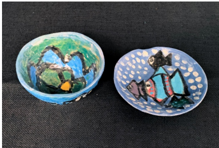
Leanne Rose Fish Bowl and Plate set , 2019 Glazed ceramic RI-LR002 A$ 45.00