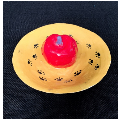
Chloe Jenkins 3D Apple , 2019 Glazed ceramic RI-CJ002 A$ 35.00