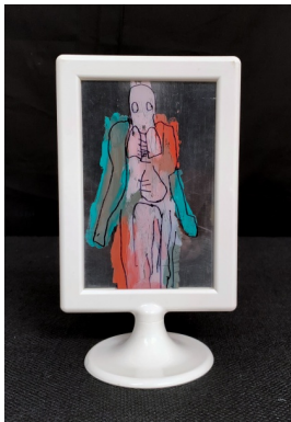
Theo Macpherson Xray- 2 sides , 2019 Mixed media 21h x 15w x 5d cm RI-TM002 A$ 150.00