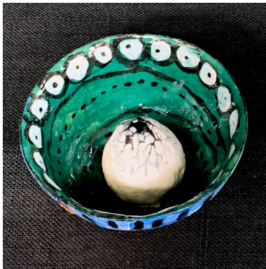
Zoe Colcheedas Egg Bowl , 2019 Glazed ceramic RI-ZC001 A$ 20.00