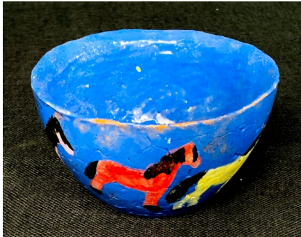
Chloe Jenkins Horses Bowl , 2019 Glazed ceramic RI-CJ003 A$ 30.00