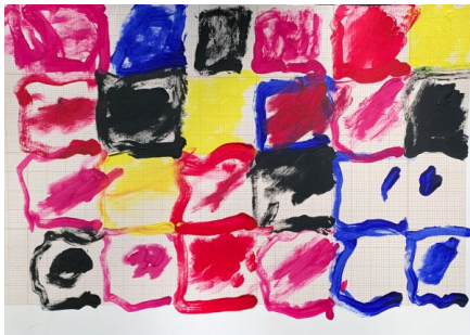
Naikia Taylor Coloured Grid, 2019 Acrylic on paper 40h x 50w cm RI-NT001 A$ 100.00