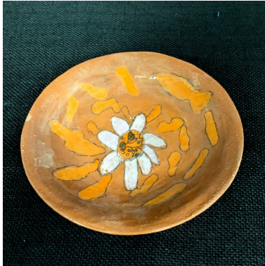
Rachel Moss Daisy Plate , 2019 Glazed ceramic RI-RM002 A$ 15.00