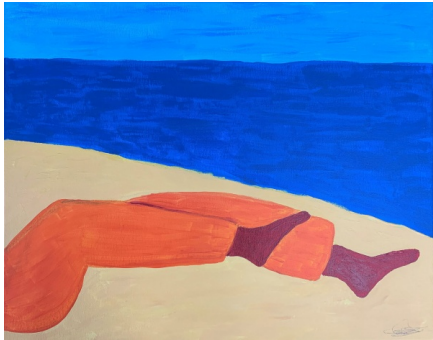
Jacob Staff On the Beach , 2019 Acrylic on canvas 40h x 50w cm RI-JS001 A$ 80.00