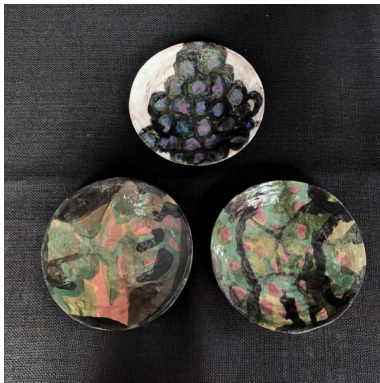
Jen Lowry Grape & Camouflage (3 plate set), 2019 Glad RI-JL002 A$ 50.00