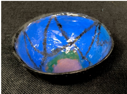
REDinc Ceramics Group Pretty Black & Blue Flower Bowl with Beki Davies & Redinc. facilitator Zilpha Menghetti, 2019 Glazed ceramic RI-CG009 A$ 20.00