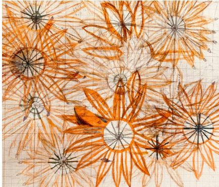
Jen Lowry Untitled, 2019 Mixed media on lithography paper 57h x 69w cm RI-JL001 A$ 500.00