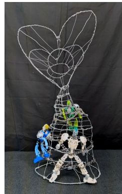
Justine Rose It's Hard , 2019 Mixed media 43h x 20w cm JRose001 A$ 150.00