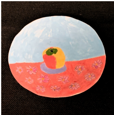
Chloe Jenkins Apple Plate , 2019 Glazed ceramic RI-CJ001 A$ 20.00