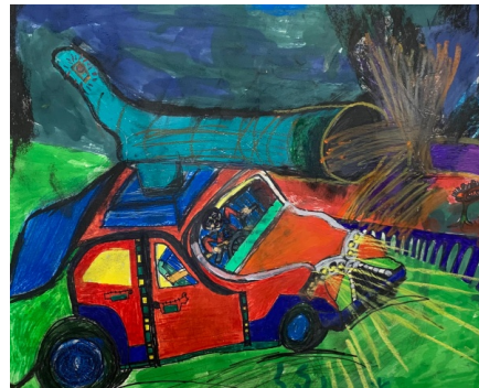
Shane Aaron Little Wars from the 21st Century!! , 2019 Mixed media on paper 42h x 59w cm RI-SAL001 A$ 410.00