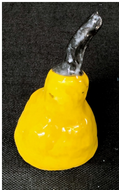
Nikola Coby Pumpkin Pear , 2019 Glazed ceramic RI-NC001 A$ 20.00