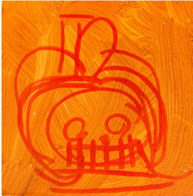
Tim Thompson Chucky , 2019 Acrylic on canvas 20h x 20w cm TT001 A$ 50.00