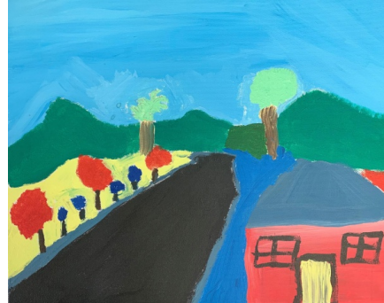
Theresa Graham My Street , 2019 Acrylic on canvas 40h x 50w cm RI-TG001 A$ 80.00