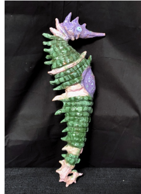
Jen Lowry Seahorse , 2019 Glazed ceramic RI-JL005 A$ 100.00