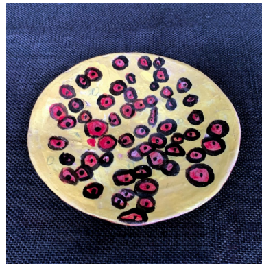
Rachel Moss Cherries Plate , 2019 Glazed ceramic RI-RM001 A$ 15.00