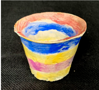
REDinc Ceramics Group Striped Cup with Beki Davies & Redinc. facilitator Zilpha Menghetti, 2019 Glazed ceramic RI-CG011 A$ 10.00