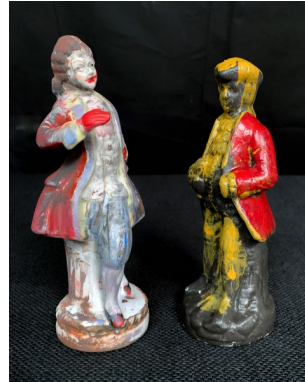
Collab Collective Shall We Dance Clublane Multitask and REDinc Studio Artists with Rene Bolten & Claudie Frock, 2019 Found ceramic objects and acrylic paint RI-CC002 A$ 80.00