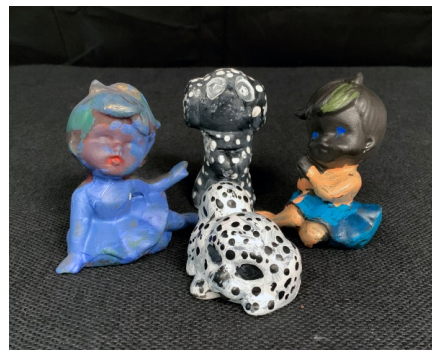
Collab Collective Play with us Clublane Multitask & REDinc Studio Artists with Rene Bolten & Claudie Frock, 2019 Found ceramic objects and acrylic paint RI-CC004 A$ 80.00