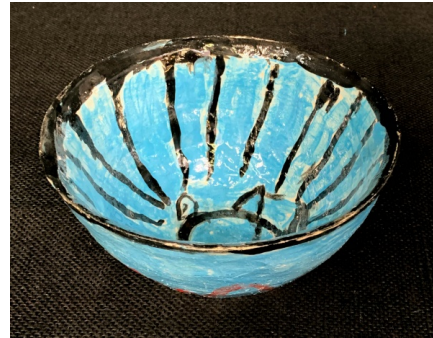
REDinc Ceramics Group Black Stripes & Blue Bowl with Beki Davies & Redinc. facilitator Zilpha Menghetti, 2019 Glazed ceramic RI-CG008 A$ 20.00