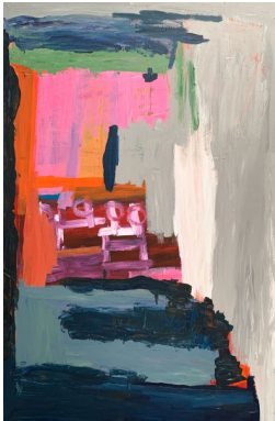
John Rose John Rose, Building , 2019 Acrylic on canvas 140h x 96w cm RI-JROSE001 A$ 600.00