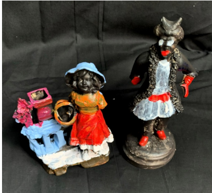
Collab Collective Christmas Time Soon Clublane Multitask and REDinc Studio Artists with Rene Bolten & Claudie Frock, 2019 Found ceramic objects and acrylic paint RI-CC010 A$ 80.00