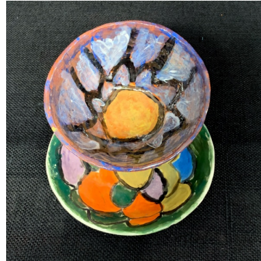
Leanne Rose Sunflower and Bloom Bowl set, 2019 Glazed ceramic RI-LR001 A$ 45.00