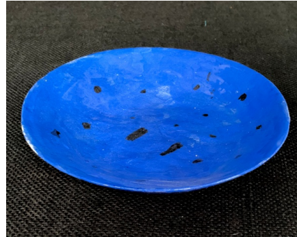
REDinc Ceramics Group Black Spots & Blue Plate with Beki Davies & Redinc. facilitator Zilpha Menghetti, 2019 Glazed ceramic RI-CG004 A$ 15.00