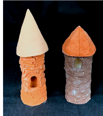
Tiffany Hilder Two Towers , 2019 Glazed ceramic RI-TH002 A$ 100.00