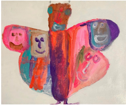
Lee Spykers Butterfly Man , 2019 Acrylic on canvas 25h x 35w cm RI-LS001 A$ 75.00