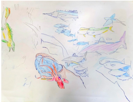
Nathan Goolet Sea Menagerie , 2019 Pencil on paper 42h x 60w cm RI-NG001 A$ 250.00