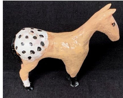
Chloe Jenkins Palamino Horse , 2019 Glazed ceramic RI-CJ004