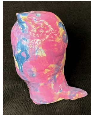
Nikola Coby Bird , 2019 Glazed ceramic RI-NC002 A$ 15.00