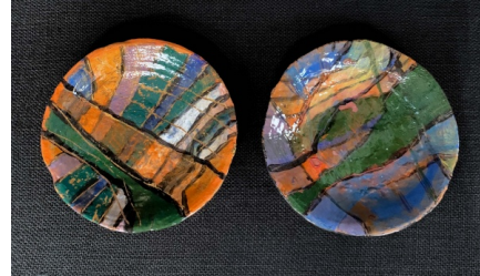
Lucas Wright Bold & Vivid Plates , 2019 Glazed ceramic RI-LW002 A$ 35.00