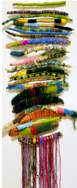
Collab Collective Collaborative Wall Hanging Redinc Craft Group, 2019 Sticks, wool RI-CC008 A$ 50.00