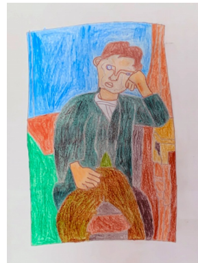
Quinlyn Seikot The Apprentice (after Modigliani), 2019 Pencil on paper 45h x 35w cm QS001 A$ 150.00