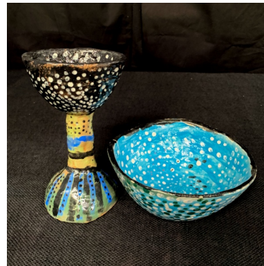
Zoe Colcheedas Magic Goblet & Dot Bowl , 2019 Glazed ceramic RI-ZC002 A$ 50.00