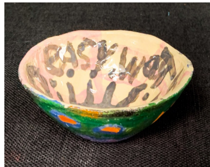
Jen Lowry Words Bowl, 2019 Glazed ceramic RI-JL003 A$ 15.00