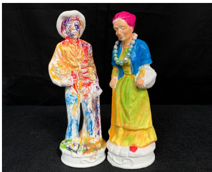
Collab Collective True Love Will Find a Way Clublane Multitask & REDinc Studio Artists with Rene Bolten & Claudie Frock, 2019 Found ceramic objects and acrylic paint RI-CC003 A$ 80.00