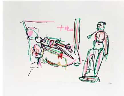
Theo Macpherson Xray-Self Portrait , 2019 pen on paper 40h x 50w cm RI-TM001 A$ 150.00