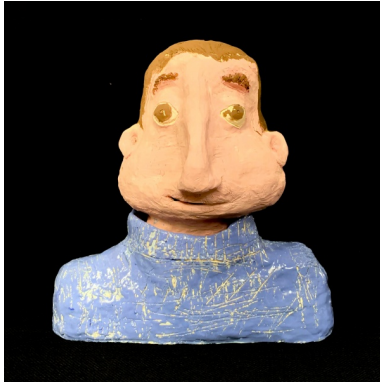
Tiffany Hilder Handsome Man , 2019 Glazed ceramic RI-TH001 A$ 100.00