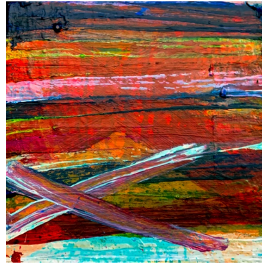
Willie Mutton Stripe Cross Colour , 2019 Acrylic on canvas 35h x 35w cm WM001 A$ 200.00