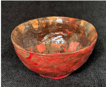
Jen Lowry Camo Bowl , 2019 Glazed ceramic RI-JL004 A$ 20.00