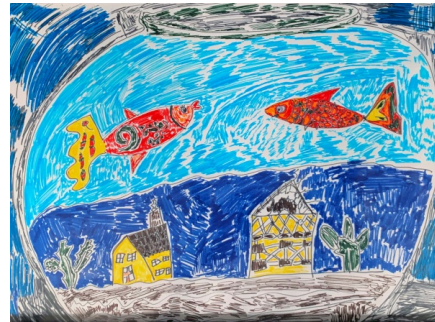
Madeleine Webster Pisces, 2019 pen on paper 29.70h x 42w cm RI-MW001 A$ 100.00