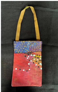
Bec King Lunch Bag , 2019 Acrylic on calico 32h x 24w cm RI-BK002 A$ 50.00